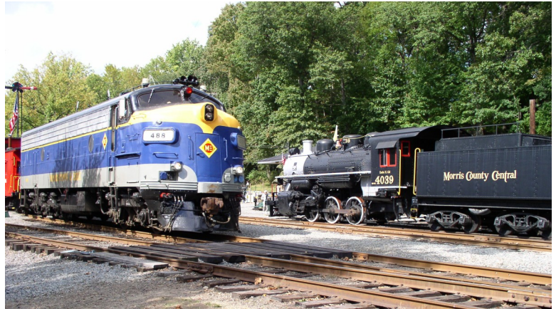
▲Morristown and Erie FL-9 number 488 meets the Morris County Central number 4039, an 0-6-0 Alco steam locomotive, at the Whippany Railway Museum.

A visit to the Whippany Railway Museum in Whippany, NJ on July 10 will be the Garden State Division's summer meet. Everyone loves ice cream and we know you already love trains. So, your Garden State Division officers thought it was about time that these two passions be put together in one event!